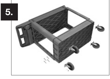
Use 4 bolts, lock washers and nuts to secure legs and casters to frame