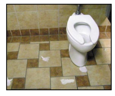
No Perforations Keeps the restroom environment cleaner

von Drehle's Jumbo Roll Tissue Systems provide a cost-effective, sanitary solution for high-traffic locations, and the high capacity rolls reduce maintenance demands as well as the possibility of run-outs.