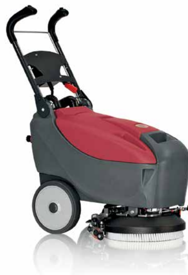
E14 Auto Scrubber

Minuteman floor scrubbers deliver impressive cleaning power in portable and compact machines that are easy to use by any type of operator