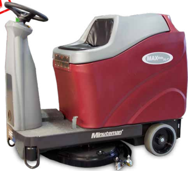
MAX RIDE 26

The MAX Ride Series are the first compact micro rider scrubbers engineered with large rider durability in mind. Built on an extremely durable e-coated steel frame with large integrated solution and recovery tank capacities, the MAX Ride maximizes productivity at an exceptional value. These innovative Micro riders with a unique squeegee assembly to brush proximity offers best in class water pick up. Enhance the Max Ride 20 or 26 with the integration of Minuteman's SPORT technology (OPTIONAL).