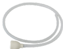
Sink fill adapter hose kit