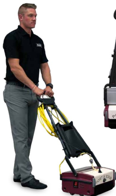
Port A Scrub 12 Cord or Battery