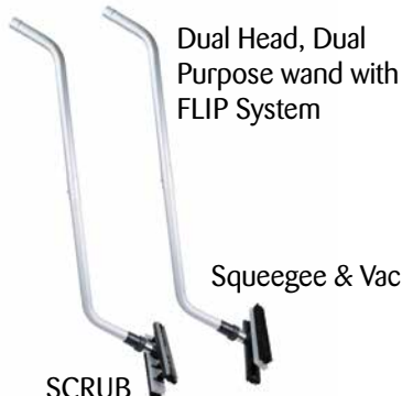
Dual Head, Dual Purpose wand with FLIP System