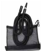
45' stretch exhaust hose with cuff, blower tool and mesh carrying bag