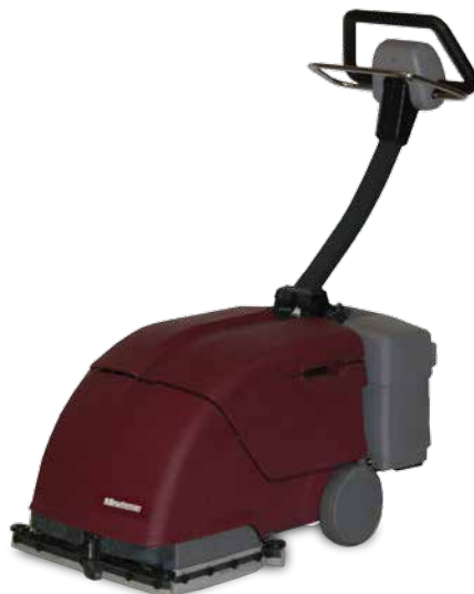
Port A Scrub 14 Cord or Battery