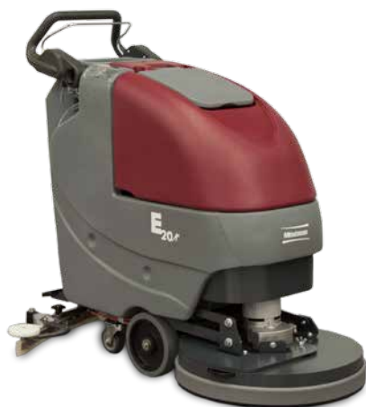
E17, E20 Disc, E20 SPORT*