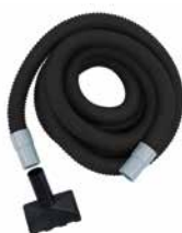
45' vacuum hose with suction tool