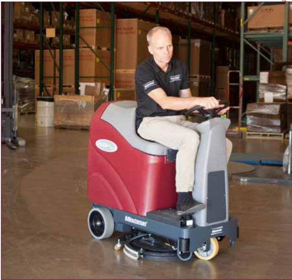
MAX RIDE 20