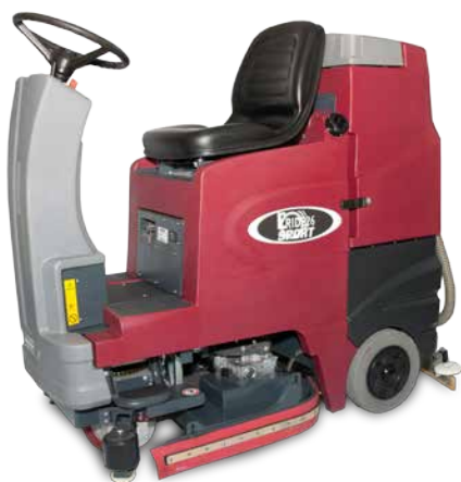
E RIDE 26, 26 ECO, and 26 SPORT