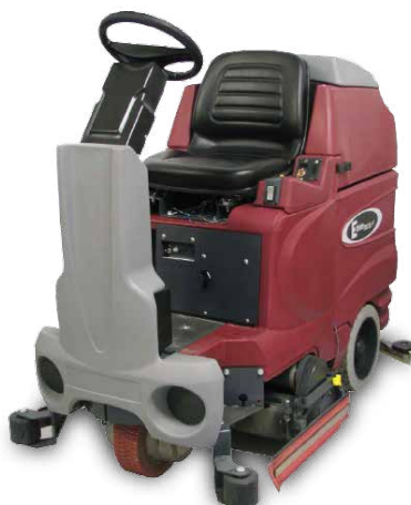
E RIDE 28 or SPORT