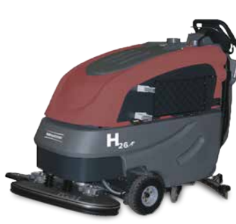
H26 for Hospitals