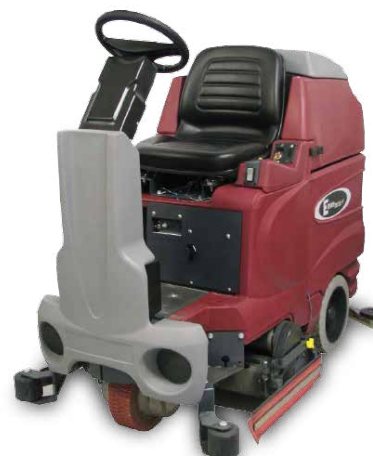
E RIDE 32 or SPORT

Covers 26,000 up to 45,450 Sq. Ft. Per Hour Automatic Scrubbing & Ergonomic Operator Comfort BIG Productivity In Compact Platform