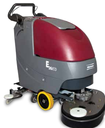
E26 ECO, E26 ECO SPORT*

Covers 17,000 up to 26,000 Sq. Ft. Per Hour Low Brush Deck Cleans Around & Underneath Obstacles Small, Compact Design for Tight Spaces