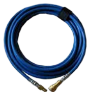
50' high pressure solution line