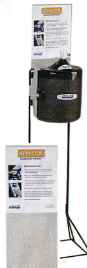
Wire Floor Stand & Acrylic Sign Holder