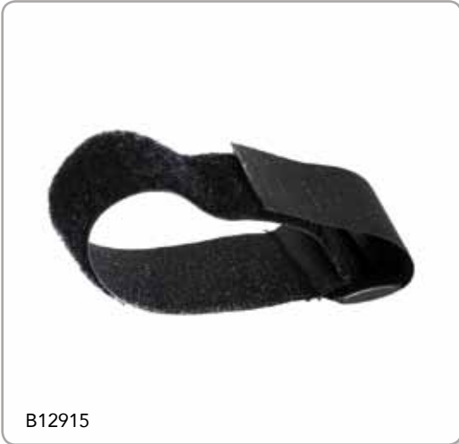
VELCRO STRAP - B12915