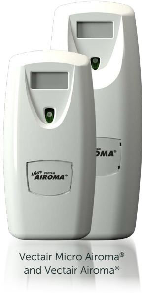
Vectair Micro Airoma® and Vectair Airoma®