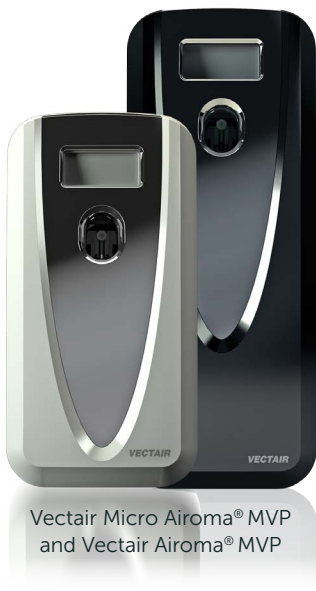
Vectair Micro Airoma® MVP and Vectair Airoma® MVP