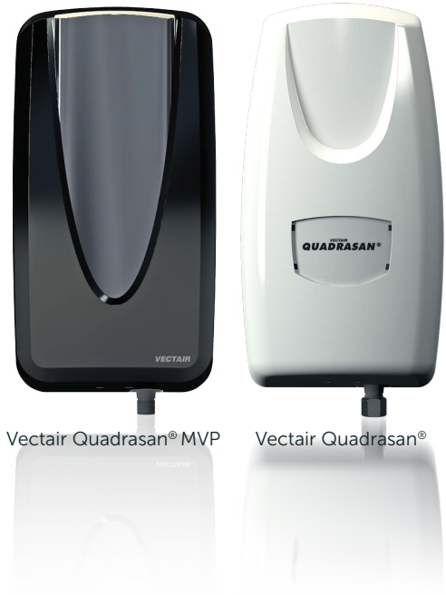
Vectair Quadrasan® MVP