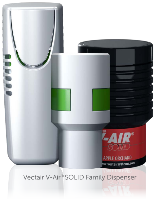
Vectair V-Air® SOLID Family Dispenser