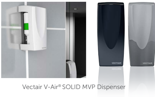
Vectair V-Air® SOLID MVP Dispenser