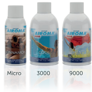
Micro 3000 9000