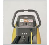
Ergonomically designed all-in-one controls right at your fingertips!