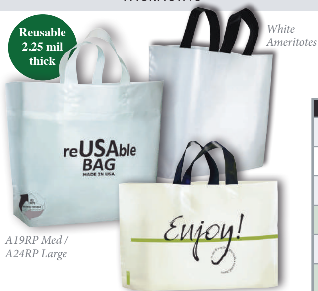
Enjoy Ameritotes (25% PCR)